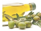
Coffee, olive oil, and the global market