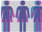
Gender & Race in Italy